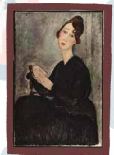
Amedeo Modigliani, Portrait of Déclaire , 1918

My paintings and sculptures resemble primitive masks. I love using simple facial lines, with almond-shaped eyes and stretched necks and faces.