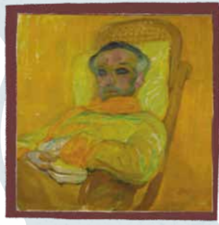
František Kupka, The Yellow Scale, 1907

Hello there! My name is František Kupka . I am known for using colours to express my emotions rather than showing objects and people as we see them in reality. Isn't that wild and fun?