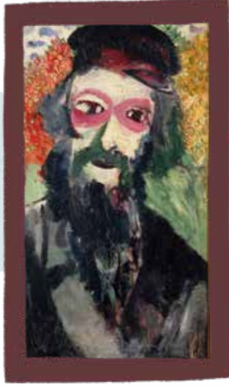
Marc Chagall, The Father , 1911 © Philippe Migéat - Centre Pompidou, MNAM-CCI / Dist. RMN-GP © ADAGP, Paris, 2019

SURREALISM is art which explores dreams and fantasy. People and objects appear in unusual colours, sometimes even floating or dancing.