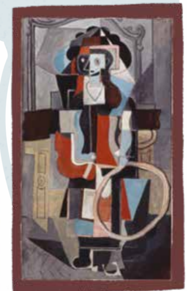
Pablo Picasso, Young girl with a hoop , 1919 © Philippe Migéat - Centre Pompidou, MNAM-CCI / Dist. RMN-GP © Succession Picasso 2019

There you are! I'm Pablo Picasso. I always wanted to paint differently, so I taught myself using elements from my imagination and childhood. My paintings often look like they have been broken up into small geometric shapes.